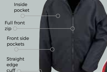
INNER SOFTSHELL JACKET

R400M&F FABRIC OUTER: WATERPROOF 3000mm, BREATHABLE 3000g, WINDPROOF INNER: SHOWERPROOF, WINDPROOF LINING: 100% Polyester INNER JKT: 280g/m 2 100% Polyester 2-layer soft shell OUTER JKT: 100% Polyester ripstop